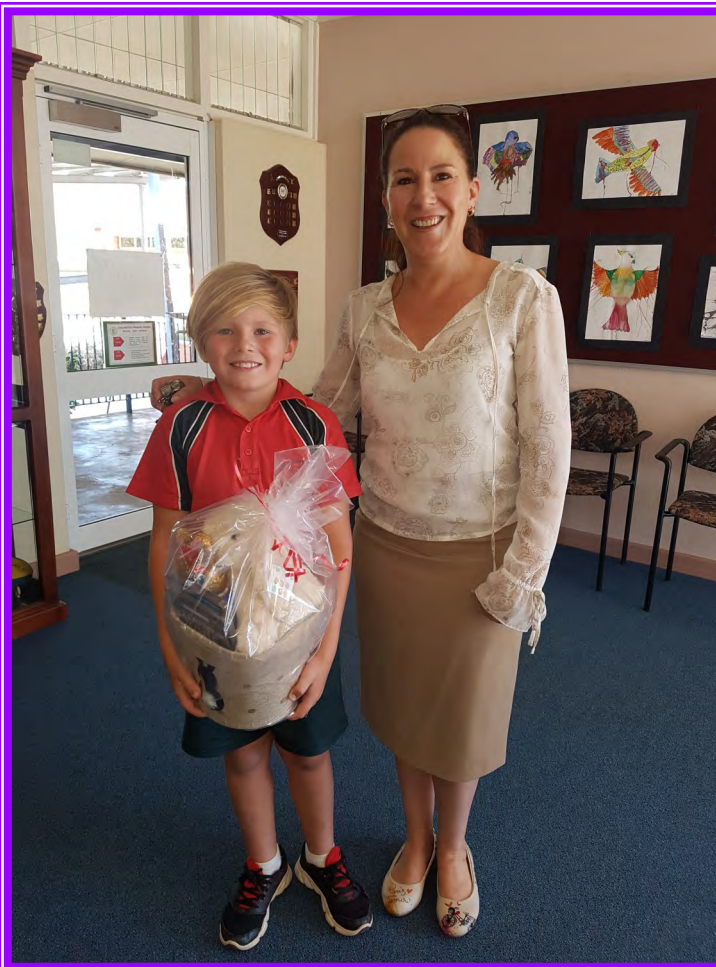
Our excited winners of the P&C Easter Raffle