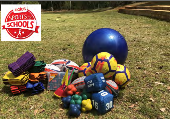
Here are some of the great rewards we received from the COLES Sports for Schools Vouchers